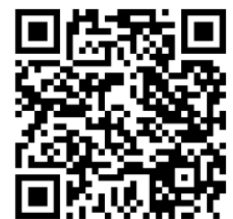
Scan Qr Code to Volunteer